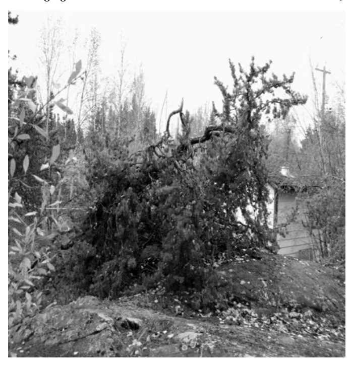
Figure 3 The Rocks. If you want to rest, if you are tired you can rest on the rock. I rested on the rock. It's uncomfortable, and it's comfortable.

The Tree. The tree clears the air and it's healthy. It's part of nature, part of the world. We need the tree. It makes me happy because it looks nice there. It makes it nice for the city. It makes me feel sad for the tree being in the cold weather. It is challenging to be in the cold. I've been out in the cold and it's cold, very cold.